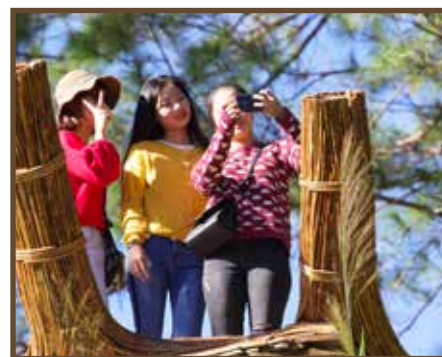
What Vietnamese kids do with their friends

welcoming people. I saw no evidence of the scars of war. Instead, I saw proof of the amazing resilience of nature, both plant and animal. I'm sure beneath the surface, scars remain, but we even drove on portions of the old Ho Chi Minh Trail near the Laotian border, now a paved, limited access highway, and simply saw lush, green hills and valleys, new hydroelectric projects, massive electric power transmission lines. Hanoi is a bustling city of 7.8 million people. Ho Chi Minh City is a huge international mecca of 10 million, complete with skyscrapers and neon. Bicycles and mopeds have been replaced by motorcycles, lots of motorcycles, and many more cars than before. And unbelievable traffic. Dalat, a resort city of more than 400,000, has no traffic lights. Somehow, traffic manages to move and drivers generally get along.