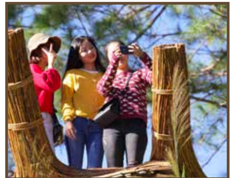
What Vietnamese kids do with their friends

What I saw was a thriving third world country with an apparently well-functioning middle class and happy,