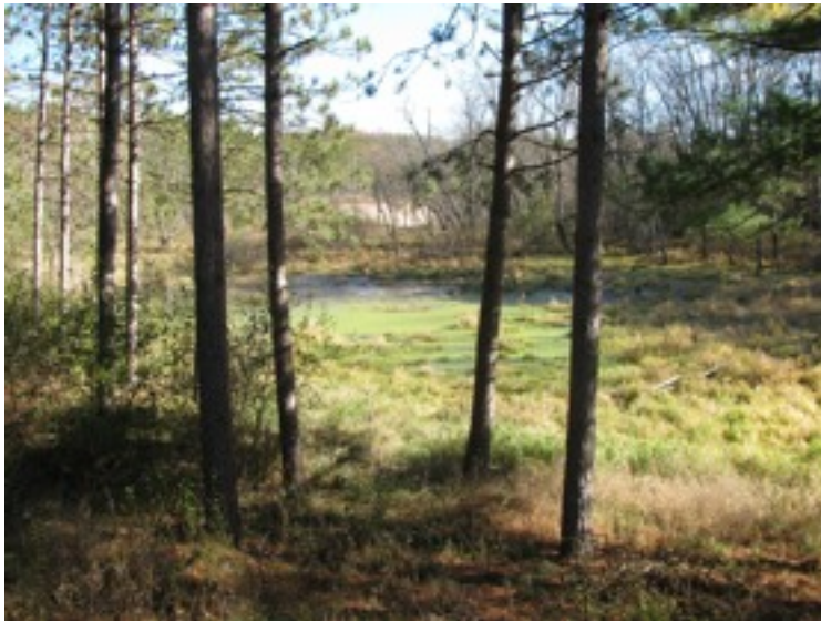
Jacobsen Easement habitat

Walking a footpath along a hogback ridge on 40 acres of family land 2 miles east of Big Rapids, Carol Baker paused and pointed down toward a swamp at the base of the ridge.