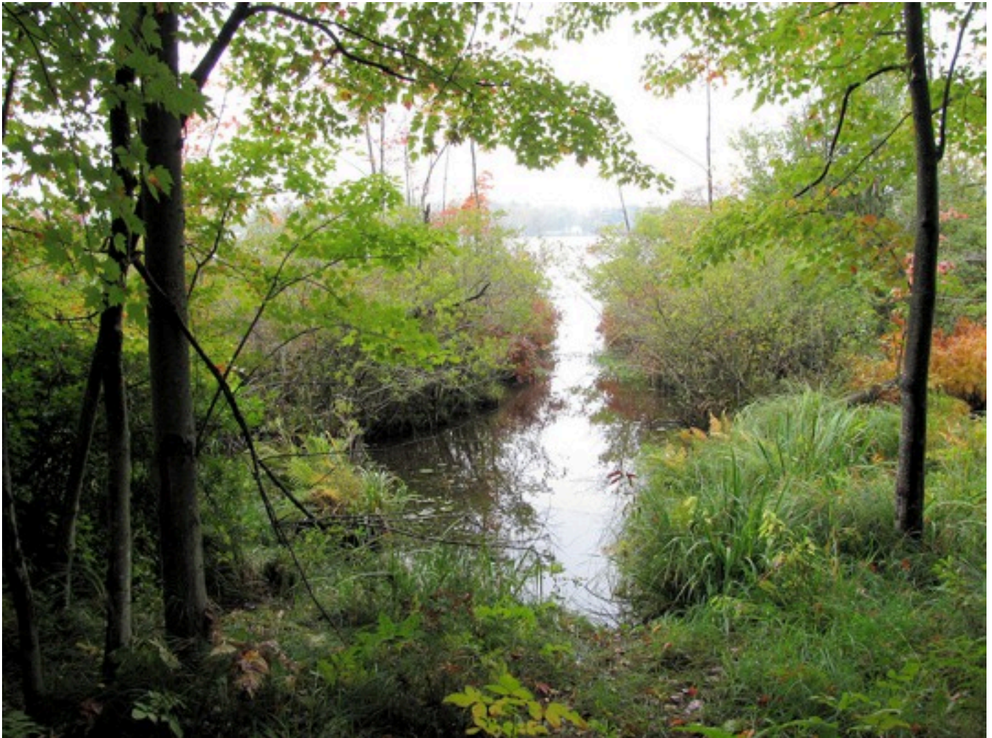
View of Hall's Lake from the Kabana tract

If you know someone who is a lapsed CWC member, or who has never joined, please share this news with them. It is a wonderful opportunity to double the value of their membership. Or, for donations over $500.00, a contribution may be matched by both foundations, effectively tripling the value of the donation. For additional information, call (989) 644-5045 or refer potential members to the web site at www.ChippewaWatershedConservancy.org . A downloadable membership form is also available on the web site.