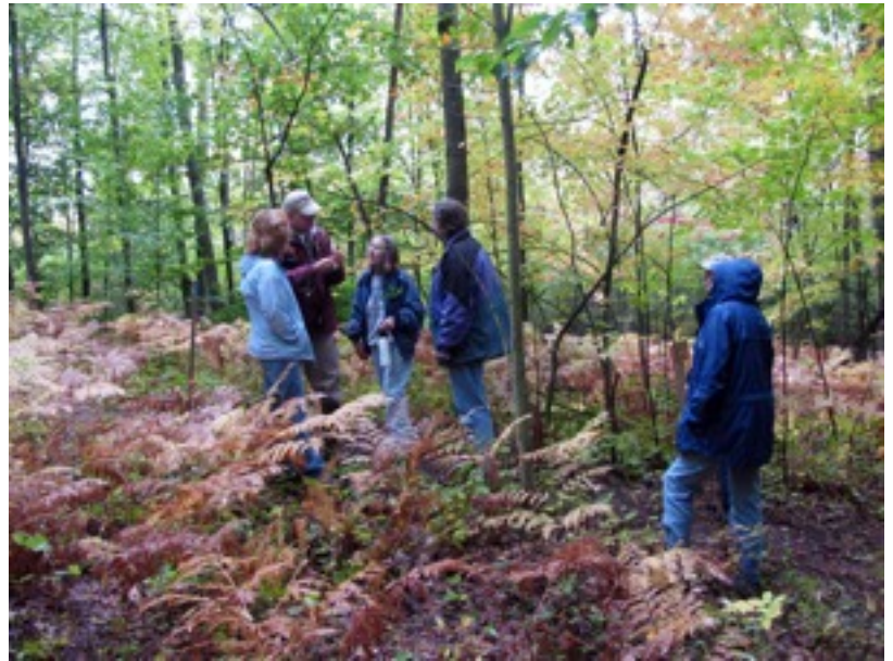
Hall's Lake Natural Area offers educational opportunities such as the 4 th Thursday nature walks

We need to raise about $300,000 to finish the acquisition of these two additional parcels. Successful completion of the Carls Foundation challenge grant and the Woollam Foundation challenge grant reported elsewhere in this newsletter will bring us $180,000 closer to that goal by the end of 2012.