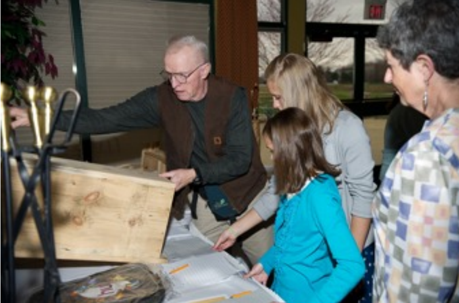
Silent auction bidders at last year's Spring Banquet

The social hour begins at 5:30 pm. You can greet old friends and take advantage of an early opportunity to cruise the silent auction tables and start the bidding; check out the highlights of the past year's activities as shown in a continuously running slide show, or talk with members of the board of directors or staff about topics of interest to you.