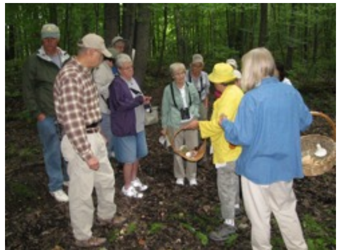
The August 4 th Thursday walk yielded a large variety of edibles.

The walks are designed to get the public out to the Neely Preserve and the adjoining two parcels of land we are fundraising to buy. The combined lands are known as the Hall's Lake Natural Area. A wonderful set of foot trails has been installed throughout the three parcels, as well as several benches where it is possible to stop and rest while enjoying a special view. The trails also feature signage identifying some of the trees encountered along the route.