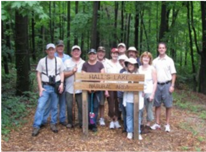
Some of the participants in the July 4 th Thursday at Hall's Lake walk pause at the end of the trail.