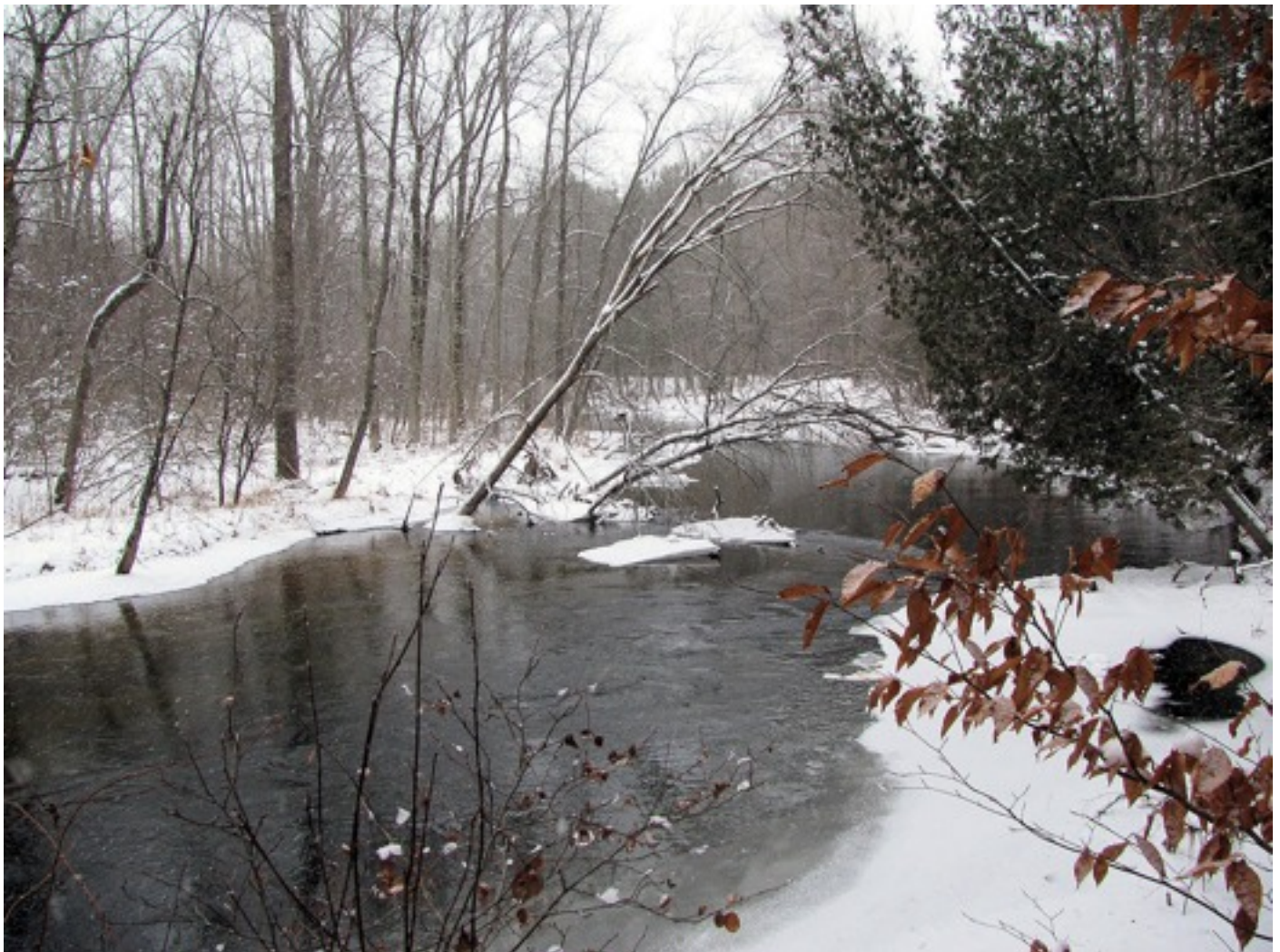
A late Fall view of the Chippewa River from the McNeel Preserve