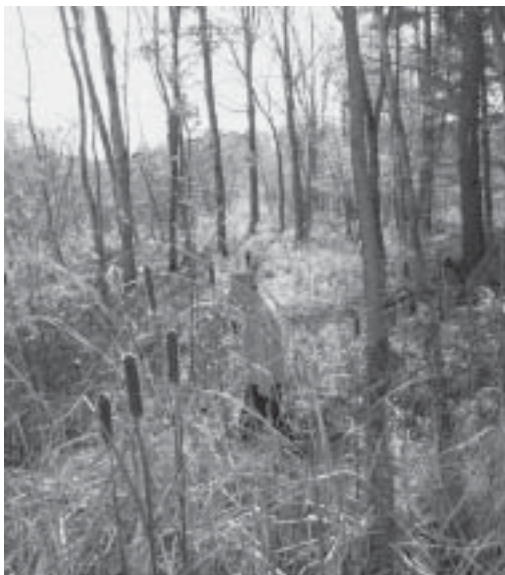
Gluczek Easement Swampland