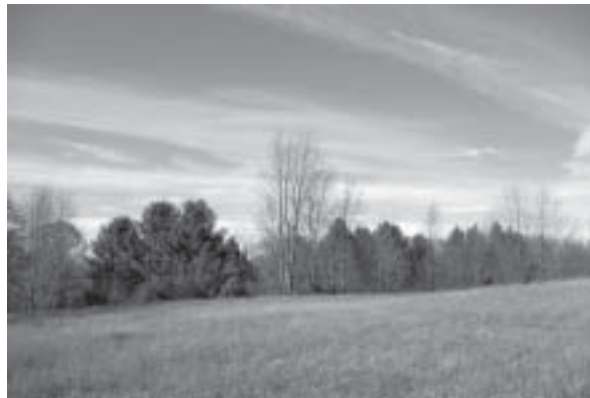
Young White Pines at Gluczek Easement

The property is situated on hilly terrain about 2 miles south of Barryton and includes some remnant beech, maple and hemlock characteristic of pre-settlement vegetation in the area. Approximately 40 percent of the land consists of wetlands and wetland soils supporting a cattail marsh and a mixed conifer swamp and flooded hardwoods. Two unnamed creeks traverse the property. "I've enjoyed watching the land transition over the years," said Steve Gluczek. "I've watched fields turn to forest and pond turn to wetland."