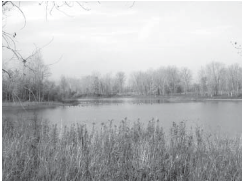
View of the Island Lake Easement (Gratiot County)